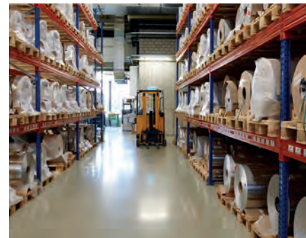
Raw material and semi-finished products storage Modern storage logistics in air-conditioned surroundings.