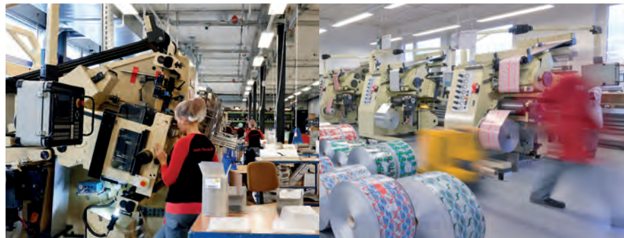
Punching shop In our cleanroom we produce die-cut lids in many different shapes on modern and powerful die-cut systems