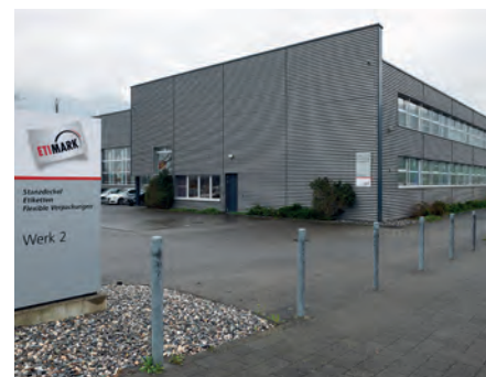
Production site 2 In the new factory at "Werdenstrasse", the production of die-cut lids has been optimized furthermore.