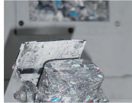
Aluminum briquetting system For a best use of aluminum waste, it is pressed to solid briquettes.