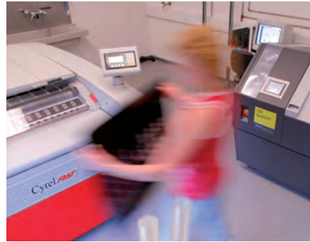
Plate production Print plates are manufactured in-house without environmentally hazardous substances and residues.