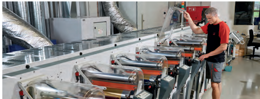
Presshall A state-of-the-art machinery, including 5 UV-Flexo-printing machines, makes us most efficient and enables us to produce high-class print quality (up to 9 colors)