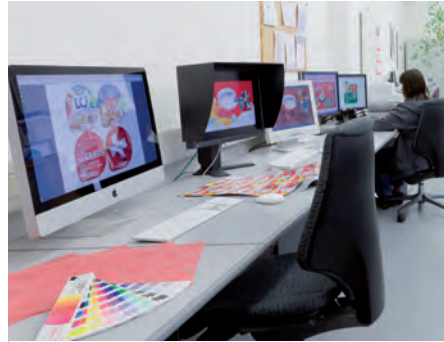
Pre-press Top quality is being achieved with in shortest time by our in-house pre-press.