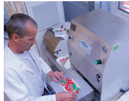
Quality control Seal test, color adhesion, EAN Code, migration test, final inspection to ensure the highest quality.