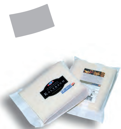
FlexoLabels FlexoPackaging FlexoLids Price Labeling

FlexoLabels Labels made of paper, plastic, labels with a metal look, with a no-label-look, with a retro design or with special effects. Etimark has the right label solution for every application area- especially tailored to your product.