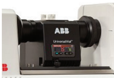
ABB is a major supplier of laboratory and process analytical systems with more than 40 years of experience in developing FT-IR and FT-NIR spectrometers for industrial, military and space applications. As part of our portfolio of products and services for process optimization, we are able to offer a full range of custom calibration modeling services and application support for industrial applications. ABB also provides extensive, globally distributed after-sales support and engineering services, as well as a full customer training program.