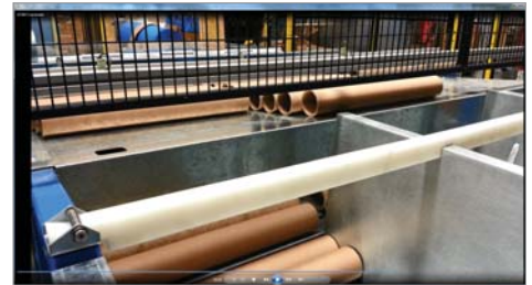
Automatic core loader accepts different core lengths for flexibility of slitting widths