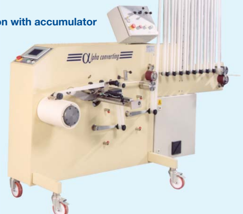
Continuous production with accumulator