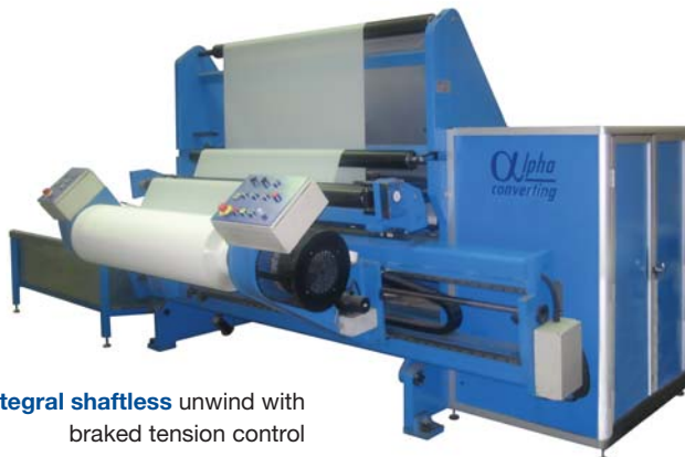
Integral shaftless unwind with braked tension control