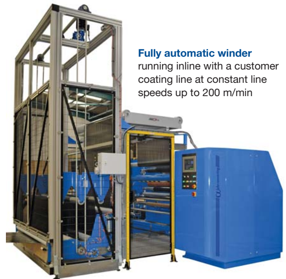
Fully automatic winder running inline with a customer coating line at constant line speeds up to 200 m/min