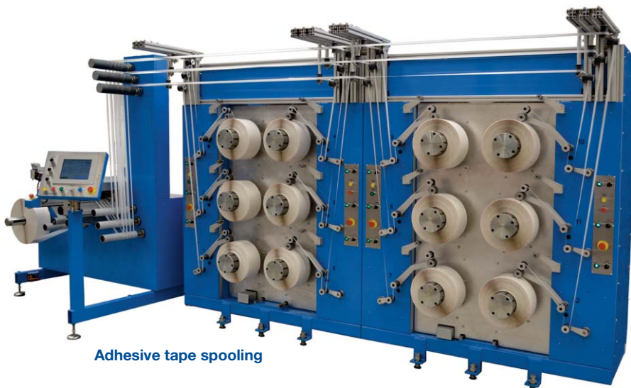
Adhesive tape spooling