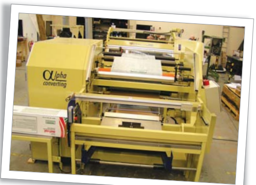
Finished rolls automatically loaded into a box on a single position ALPHAMATIC reduces operator handling