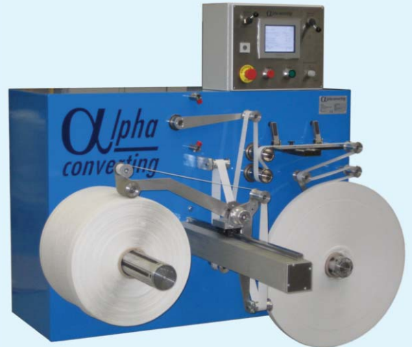
Spooling of film and non-wovens

OPP, PET, PE Cable tapes Security stripes Medical Filaments Non-woven Carry handle Water block