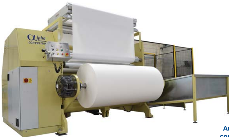
Integral shafted unwind with AC drive motor