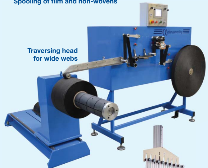
Traversing head for wide webs