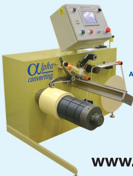
Adhesive tape spooling